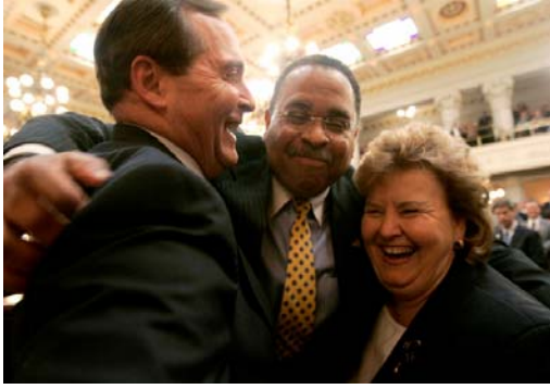
Attorney General Jim Petro, left, Secretary of State Kenneth Blackwell and Auditor Betty Montgomery hold an impromptu "group hug" before Gov. Bob Taft's State of the State speech Jan. 25 in Columbus. Blackwell and Petro are locked in a bitter primary fight for governor. Montgomery bowed out of the race Jan. 24.